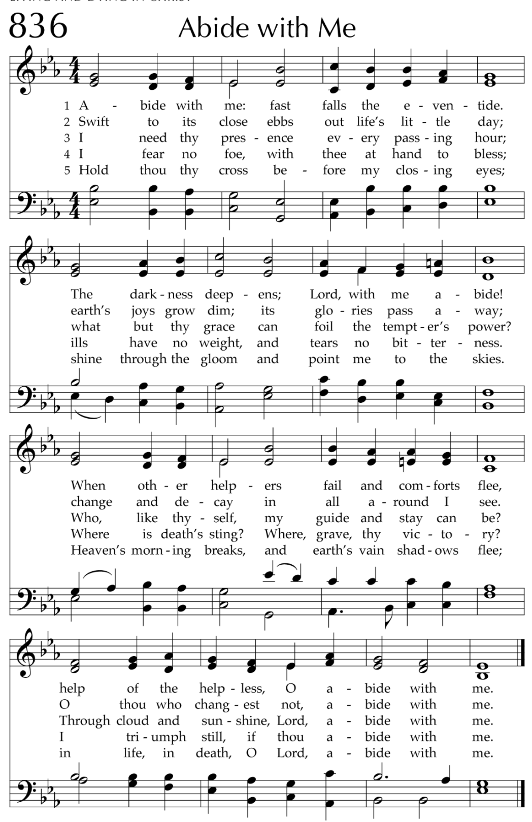
By blending end of day and end of life, the imagery of this well-known Victorian hymn has made it valuable for both evening services and funerals. Although the author wrote his own music for it, the present tune has been firmly associated with this text for over 150 years.